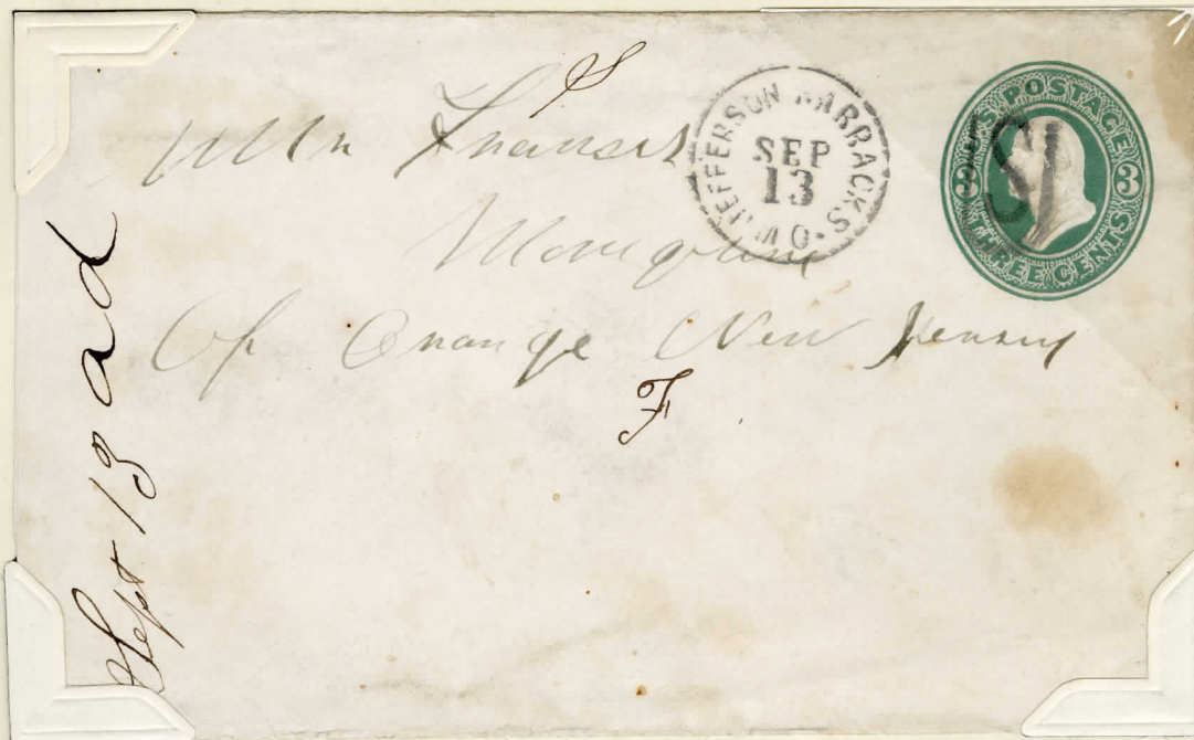
Jefferson Barracks Hard Paper

Jefferson Barracks, Mo. - 1874-86 #U163, 3 c green envelope; War Departments with Jefferson Barracks \text{\textcircled{S}} cancellations, Hard paper 1 c , 2 c , 3 c , 6 c , 7 c , and horizontal strip of 3 12 c ; Soft paper 3 c , 6 c and 12 c