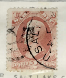
SALT LAKE C UTAH