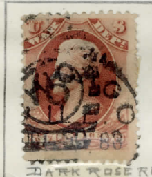
DARK ROSE RED CHICAGO