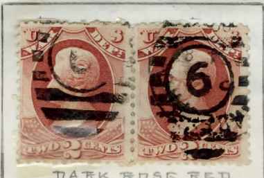
DARK ROSE RED PHILA.