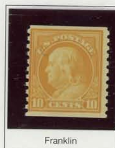
Franklin OG 497 NH