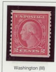
Washington (III) 492