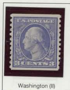
Washington (II) 494