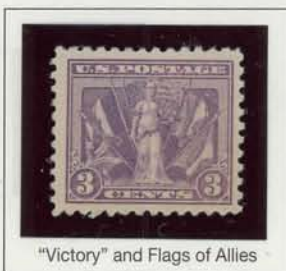
"Victory" and Flags of Allies