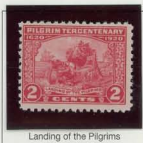
Landing of the Pilgrims