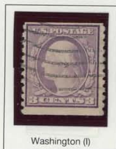
Washington (I) 493