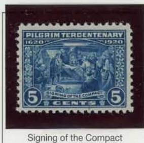
Signing of the Compact