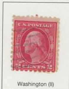
Washington (II) 491