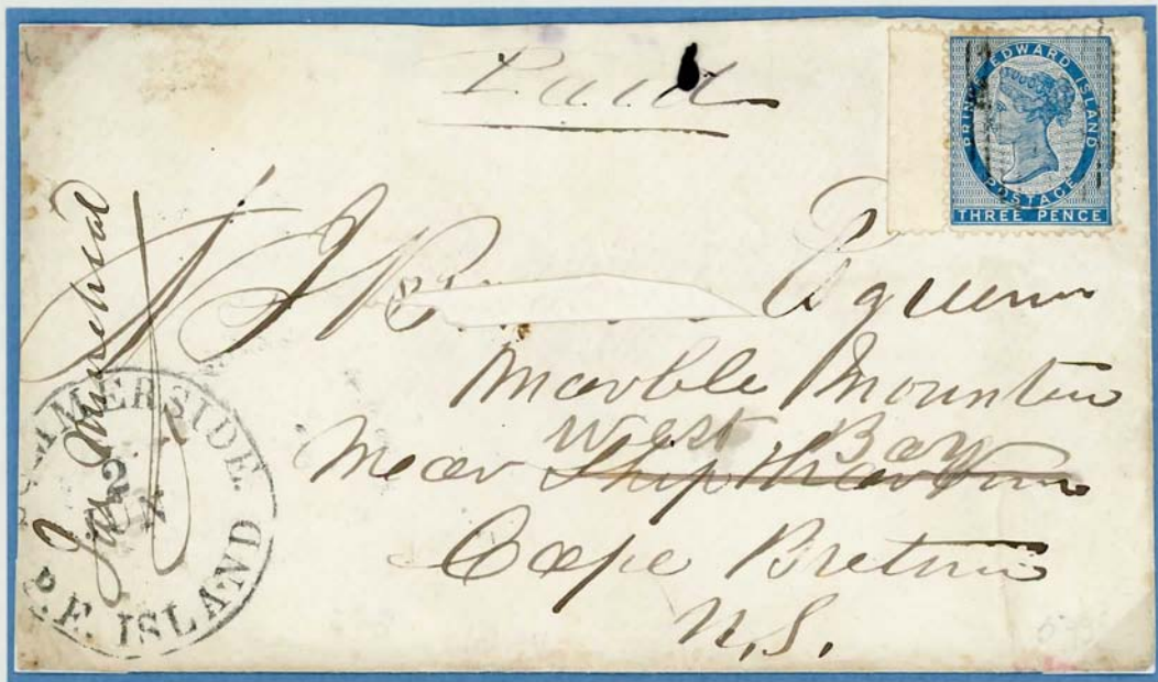
2nd June 1868, Summerside, 1863 left marginal 3d. blue on cover via Charlottetown (2/6), Pictou (7/6), Plaister Cove (9/6) to West Bay (backstamped 12/6, unrecorded by MacDonald). Marginal stamps of PEI are virtually unrecorded on cover. Provenance : T.W. Hall